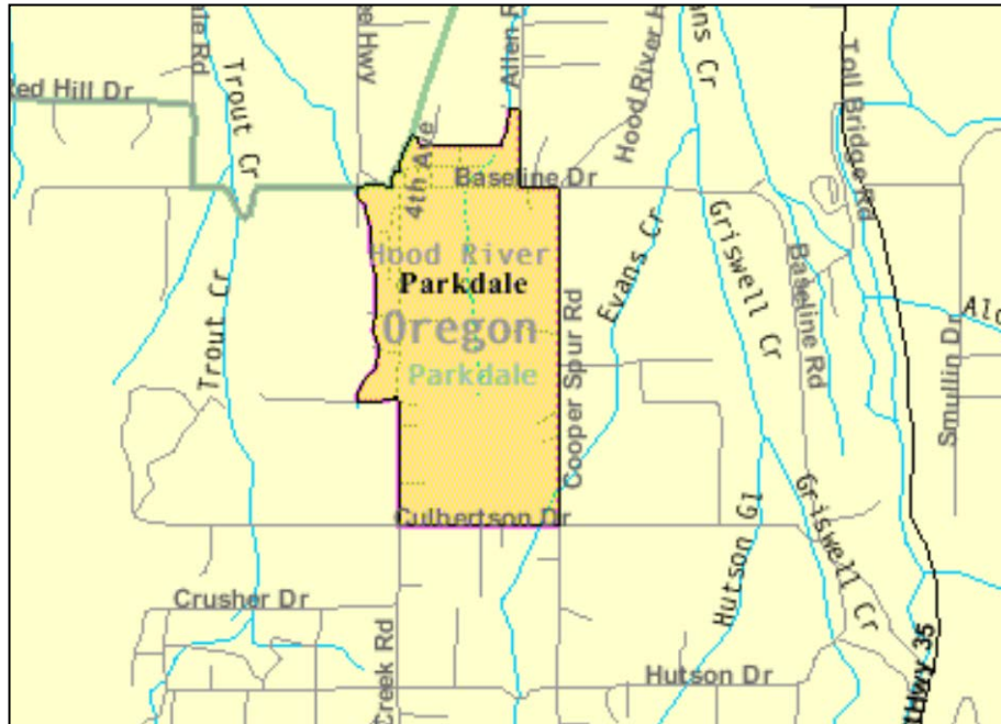
FIGURE 2 PARKDALE CENSUS DEFINED PLACE (CDP)

CDP provide the most accurate analysis of existing conditions within the Parkdale community boundary. However, 1990 Census figures are not available for the Parkdale CDP, meaning that historical trends cannot be used to directly estimate population and housing projections for this area. Therefore, these projections are made using figures from the 1990 and 2000 Censuses for the Parkdale CCD. For the purposes of these projections, it is assumed that trends in population and housing growth for the Parkdale CCD are similar to trends within the community boundary.